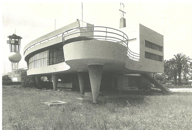
THE AIRPORT CLUBHOUSE IN 1998